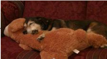
Sport with his baby