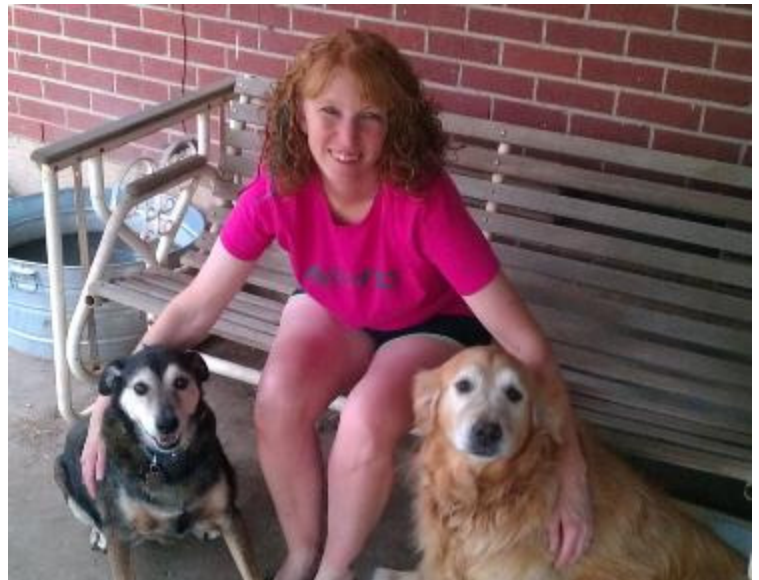
With Sport & Sable