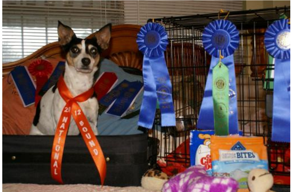
Jett's bags are packed and she's ready to go ...