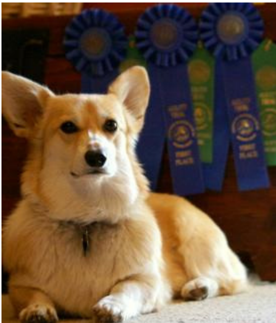
Emmy's Awesome Debut !