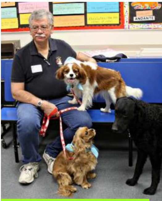
Patiently waiting for the kids