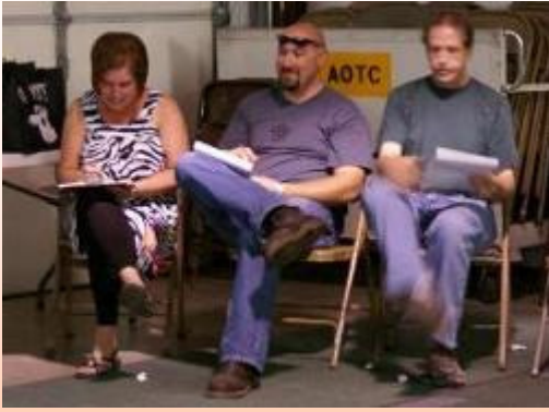
The Judges hard at work scoring the following WINNERS ...