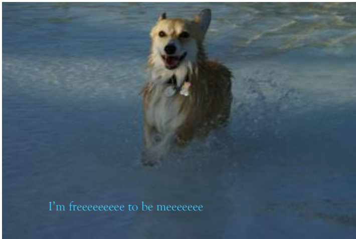
I'm freeeeeeee to be meeeeeee