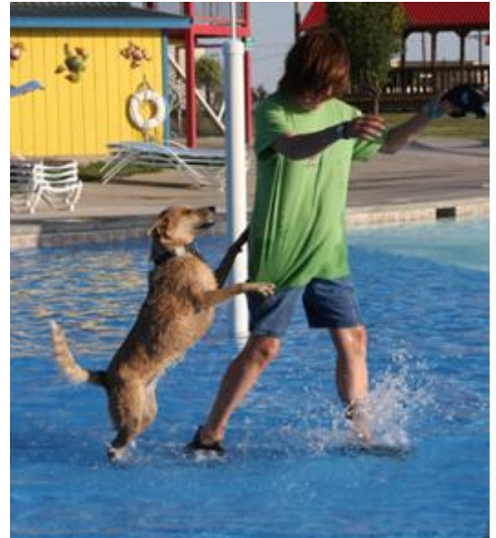
Dancing also works in any situation