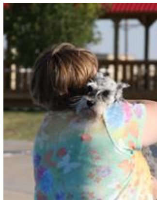
Hugs work in any situation