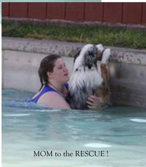
MOM to the RESCUE !