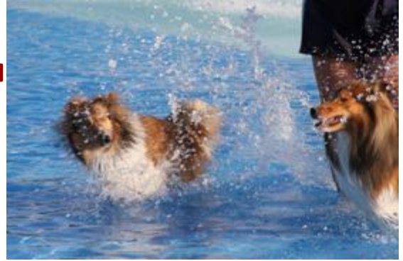
the sheltie shake..water version