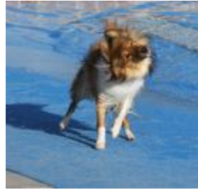
the sheltie shake..land version