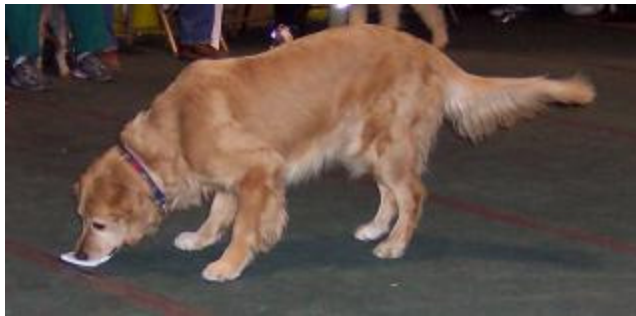
Tag fetching Joe's dropped items